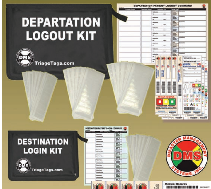
DMS-05719 Hospital Evacuation Kit

The DMS-05719 Hospital Evacuation Kit and the DMS-05721 Facility Evacuation Kit (for extended care and retirement residences) were designed to facilitate an efficient evacuation system through the use of door stickers utilizing colored check-box prioritization in consideration of patients' mobility. Patients with highest mobility would be categorized as first evacuees, Red, while patients with the least mobility would be categorized Green.